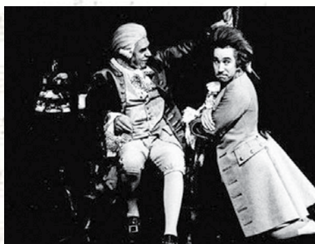
Photos from the original production of Amadeus at the Royal National Theatre in London, 1979.